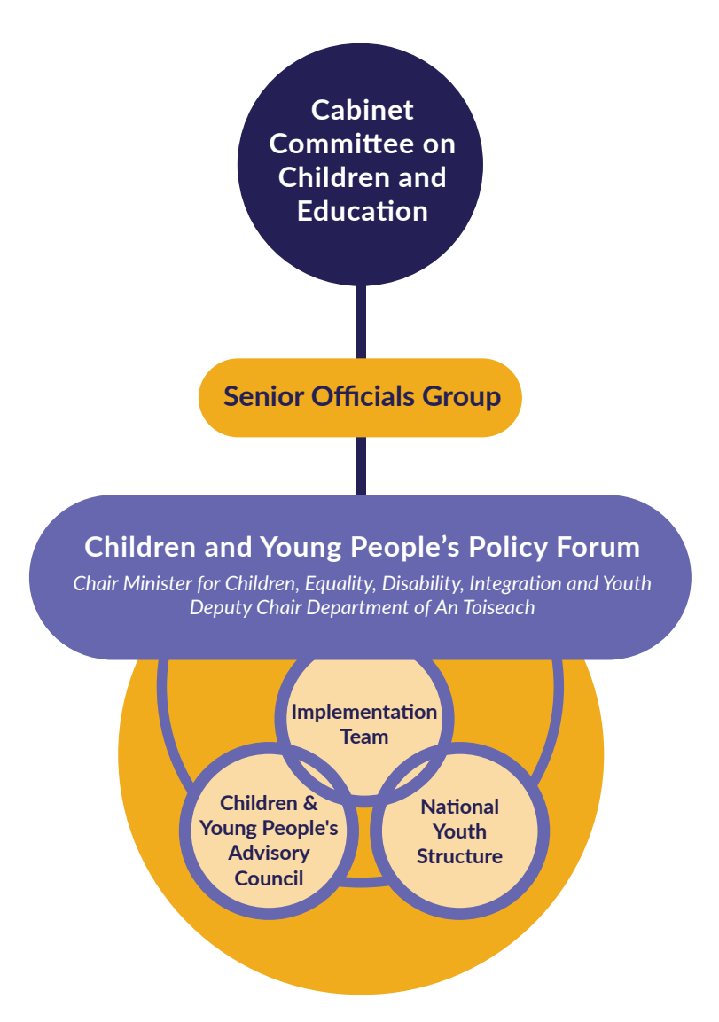
Figure 1 Child and youth policy structures

Further consideration will be given to the role these structures should play in acting as a sponsor to improve integrated delivery of services to children and young people, particularly in the context of the renewed focus on consolidating and integrating family and parental support, health and well-being services as part of the Child Poverty and Well-Being Programme.